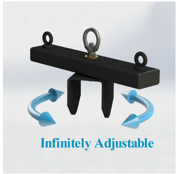
Figure 1. Polar Focus PY0 Universal Joint Fitting with Zbeam® Half

For more assistance, call our audio rigging consultants at (413) 586-4444.