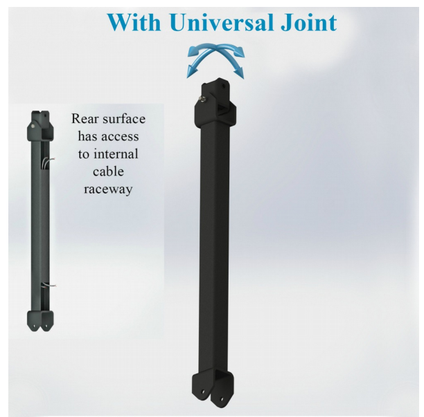
Figure 1. Polar Focus PY1 Quick Disconnect Fitting with Line Array Extension Post Allows any loudspeaker cluster to be mounted up to 16 feet below the roof attachment point.

For more assistance, call our audio rigging consultants at (413) 586-4444.