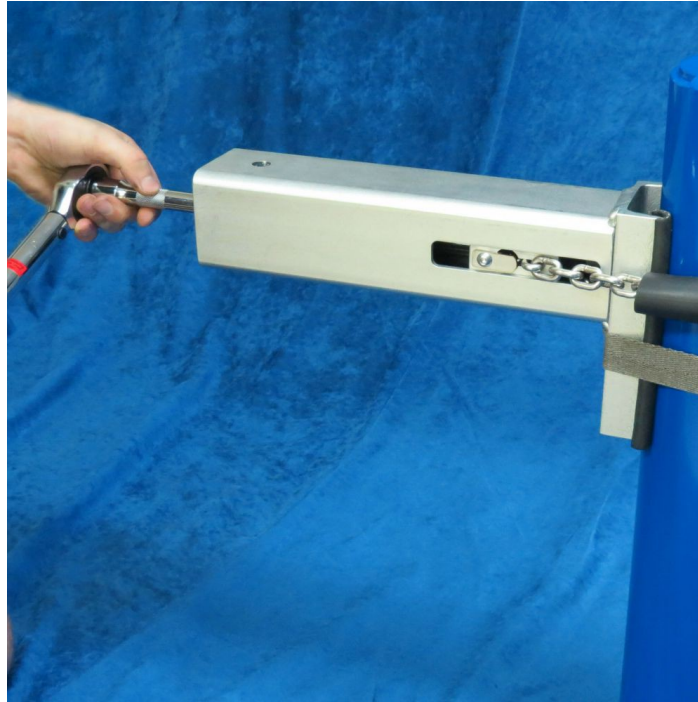
Figure 7. A torque wrench is used to apply appropriate per-tension, and prevent bolt loosening.