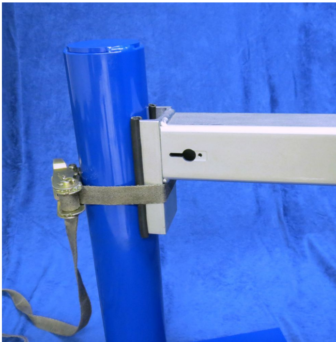
Figure 2. Use a ratchet-strap to fixture the pole mount while installing, do not over tighten or mar the pole.

6.4 Insert 1 end of the chain into the circular opening, and lock in a single link as shown in figure 3.