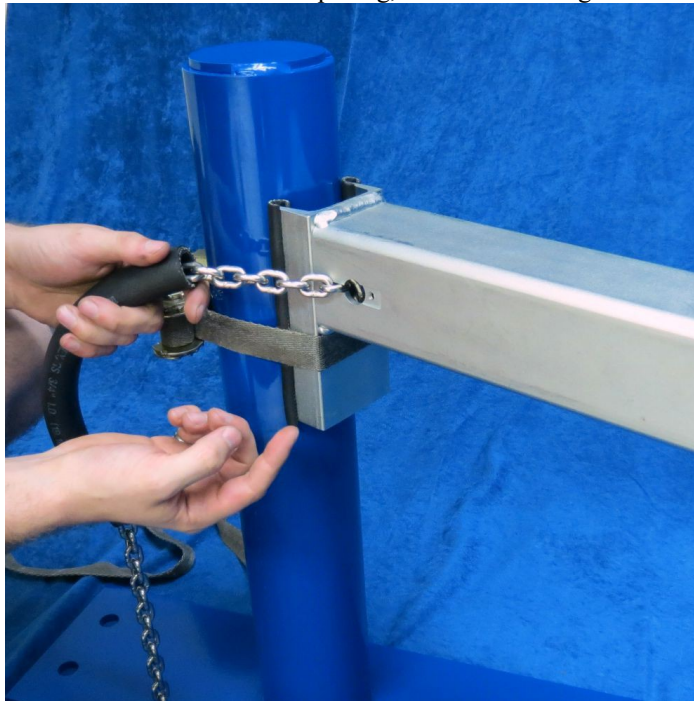
Figure 3. Chain is fed through circular opening, chain can be locked in by sliding into key-way.

6.4 Insert 1 end of the chain into the circular opening, and lock in a single link as shown in figure 3.