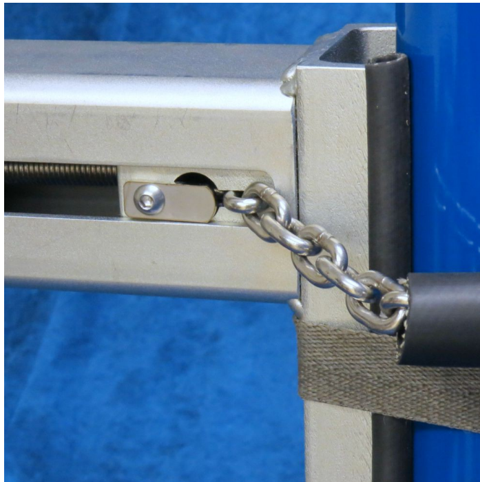
Figure 6. The second chain keeper is installed on the bolt carriage.