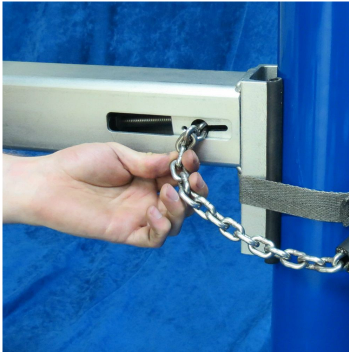
Figure 5. Excess chain is fed into bolt carriage and is stored inside the cantilever arm.