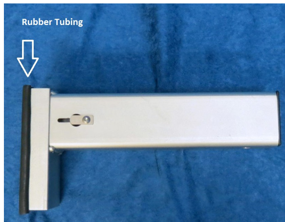
Figure 1. Rubber tube insulates Pole Mount from pole and prevents marring of the pole.