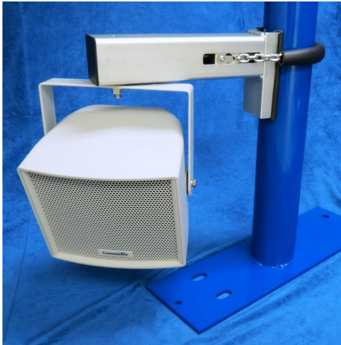
Figure 8. Speaker mounted in lower position with end plug installed.

Note: Wire may be run through the body of the cantilever arm and out the rear drain hole for a clean installation. Run the wire into the arm by drilling hole in plastic tube cap or in convenient location in arm. If putting hole in arm always apply cold-galvanize spray to hole. Any aftermarket holes in steel will void warranty.