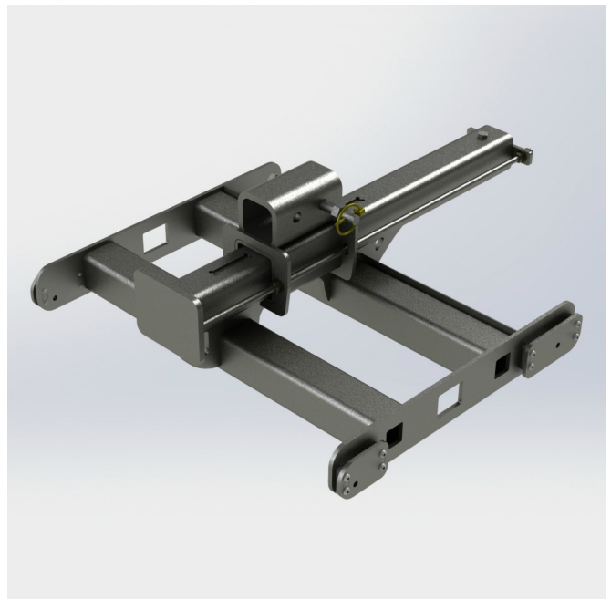
Figure 2. OME-EGRET-B