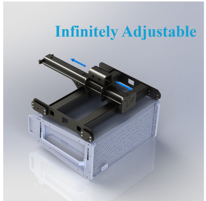
Figure 1. OME-EGRET-B

See www.linearrayframes.com for a full family of accessories.