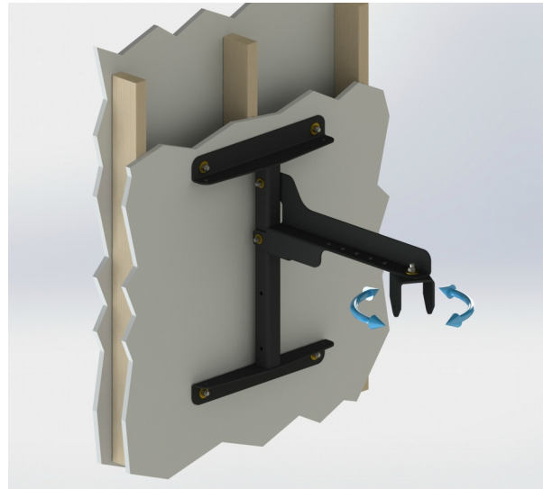
Figure 1. Polar Focus PY0 Quick Disconnect Fitting with Wall Mount

To determine if a wall is structural; contact a local structural engineer, building inspector, or other qualified individual.