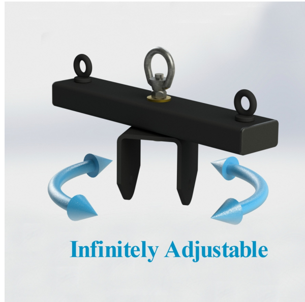
Figure 1. Polar Focus PY0 Universal Joint Fitting with Zbeam ® Half Allows for two point support of a cluster for permanent installations with a center service pick point with full pan control.

For more assistance, call our audio rigging consultants at (413) 586-4444.