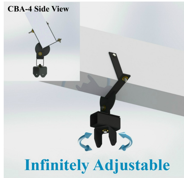
Figure 1. Polar Focus PY1 Quick Disconnect Fitting with Type 4 Custom Beam Attachment Allows a loudspeaker cluster to be mounted to a rolled large wooden or glue-lam beam with pan control.

For more assistance, call our audio rigging consultants at (413) 586-4444.