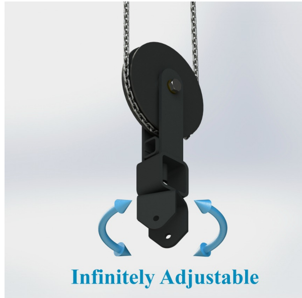
Figure 1. Polar Focus PY1 Quick Disconnect Fitting with Motor Zbeam Allows a cluster to be serviceable with up/down motion using a half ton hoist with a one ton load.

For more assistance, call our audio rigging consultants at (413) 586-4444.