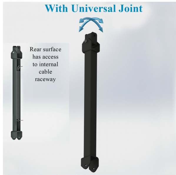
Figure 1. Polar Focus PY1 Quick Disconnect Fitting with Line Array Extension Post Allows any loudspeaker cluster to be mounted up to 16 feet below the roof attachment point.

See www.linearrayframes.com for pan control, roof attachment, OEM products, line array frames and manufacturer-specific rigging.