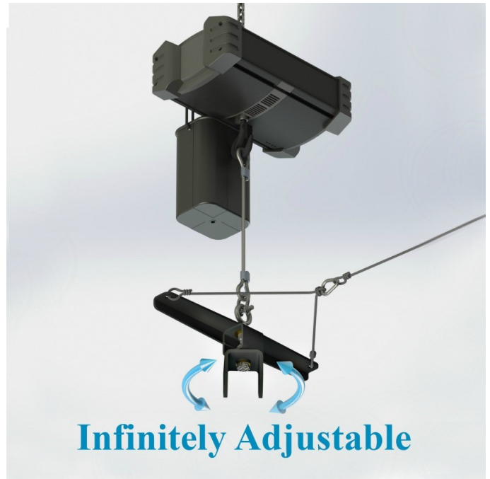
Figure 1. Polar Focus PY1 Quick Disconnect Fitting with Zbeam ® Lariat Allows a cluster to be suspended from a single hoist for portable applications, with pan control.

Polar Focus Ultimate Line Array Rigging. For more assistance, call our audio rigging consultants at (413) 586-4444.