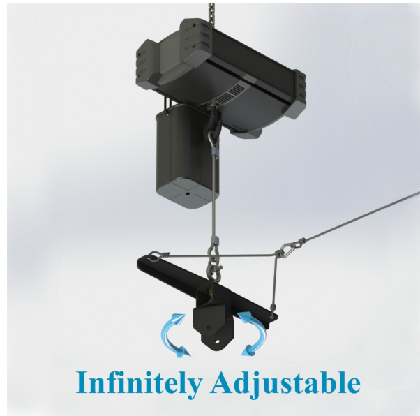
Figure 1. Polar Focus PY1 Quick Disconnect Fitting with Zbeam ® Lariat Allows a cluster to be suspended from a single hoist for portable applications, with pan control.

For more assistance, call our audio rigging consultants at (413) 586-4444.