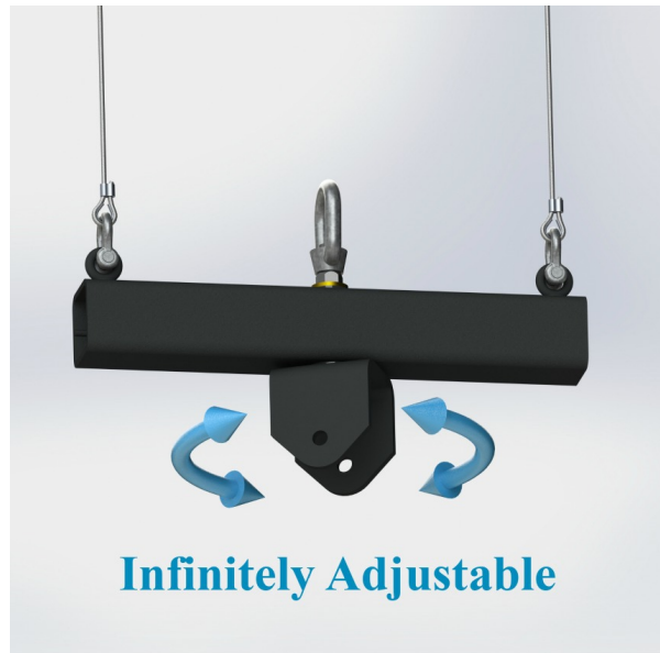
Figure 1. Polar Focus PY1 Universal Joint Fitting with Zbeam ® Half Allows for two point support of a cluster for permanent installations with a center service pick point with full pan control.

For more assistance, call our audio rigging consultants at (413) 586-4444.