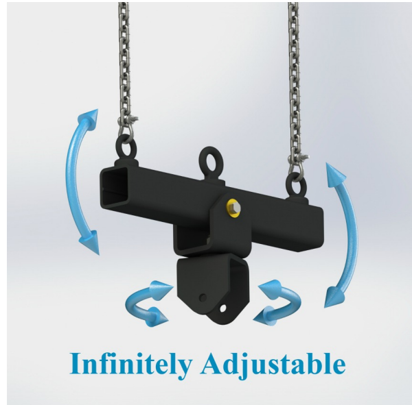
Figure 1. Polar Focus PY1 Quick Disconnect Fitting with Zbeam ® with Rocker Arm Allows for a cluster in portable or installation application to be safely lifted/supported by a pair of hoists, with pan control.

For more assistance, call our audio rigging consultants at (413) 586-4444.