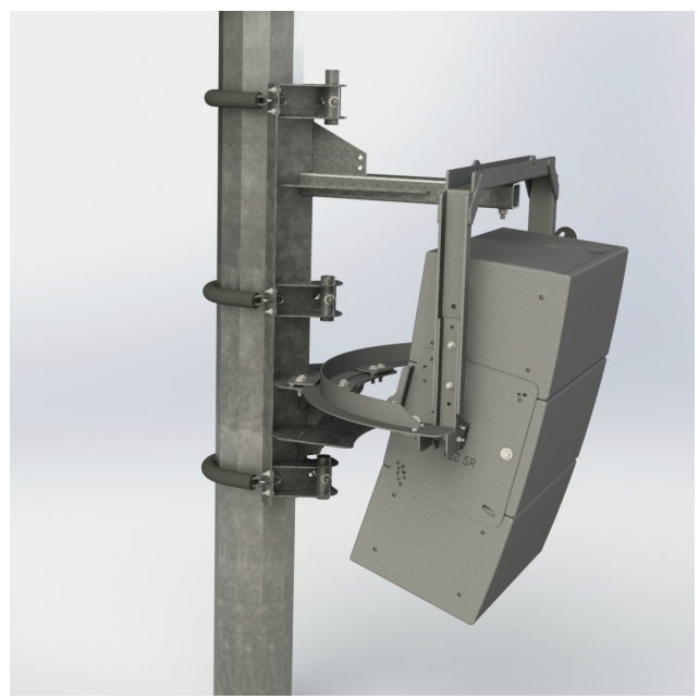
Figure 1. Polar Focus PM3-IV6-34 Pole Mount for Community Professional Loudspeakers IV6 weather rated line array showing three speakers.

The installation procedure requires a material lifting crane to lift the 121 lbs (55 kg) mount body while one or two technicians complete the assembly steps from a personnel crane. The mount is equipped with a center of gravity lifting point to facilitate safe and easy lifting. The assembled cluster in its yoke also has a matching pair of center of gravity lifting points. The initial direction of the cantilever arm must be within 15 degrees of the desired compass heading for the finished cluster.