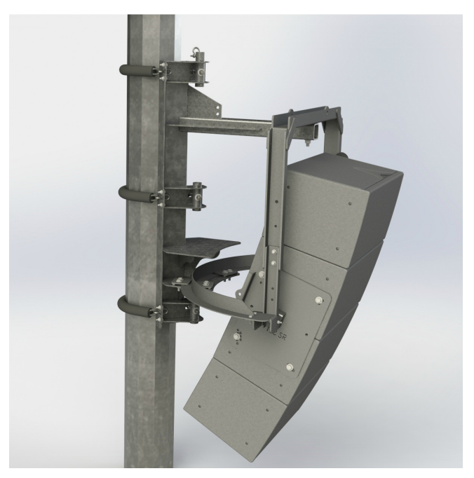
Figure 2. Polar Focus PM3-IV6-34 Pole Mount for Community Professional Loudspeakers IV6 weather rated line array showing four speakers.

* This wind rating is based on static wind speed and direction. This rating does not take into account dynamic wind speed and direction effects, nor the tendency of a pole to oscillate in high winds.